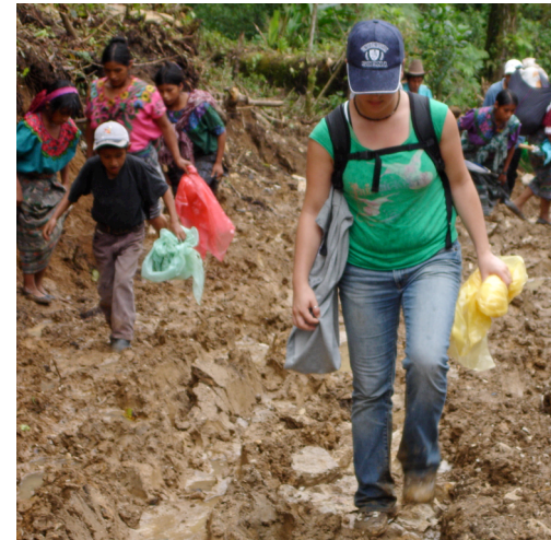
Figure 2. Walking in mud on the way back from a coffee producer village.

"Show you are capable." We arrived promptly at the office every day, and showed that we were committed to working as long as they were. We were careful to ask relevant questions, and stay focused on the task. We referred to our experience and success doing similar work in India. We backed this up with video documentation, which aroused further confidence and interest.