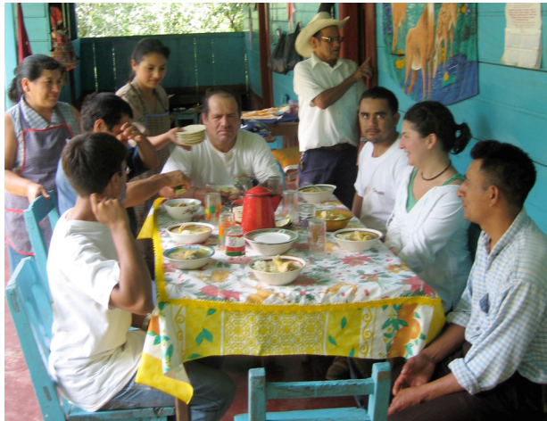
Figure 1. Enjoying a meal at a producers' family home.

"Show you are tough." We traveled regularly on the chicken bus from Guatemala City to Barillas and back (over 14 hours each way). We ate all the precious food the producers' families prepared for us. We walked in the mud for hours to coffee parcels, slept on wooden boards with a five-person producer family, rode in the back of trucks and lived in a 3 square feet guest room instead of a hotel room. This established the important precedent that we were working on equal terms.