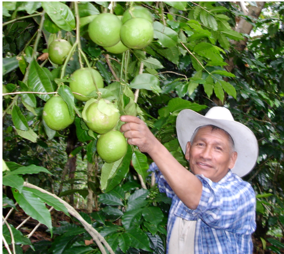
Figure 4. A producer showing his organic orange-tree during one of RANDI's in-situ evaluations.

"Take compliments with a grain of salt." People in the rural developing world are often very polite and will not plainly give a negative answer. Some are also keenly interested in acquiring new technology (for example, fancy mobile phones). Therefore, all compliments should be taken with this context.