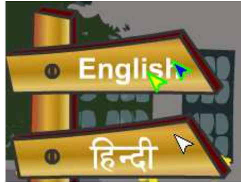
Fig. 3. In Majority mode, only a majority of users (Blue and Yellow in this case) must converge to make progress.

The key distinction is whether users have to wait for everyone to proceed. Its possible that in the Majority condition, faster users will simply ignore slower ones and proceed at their own pace. On the other hand, if slower users are still found to be engaged and active, it would indicate that the same benefits as Consensus could be achieved with reduced frustration for faster users.