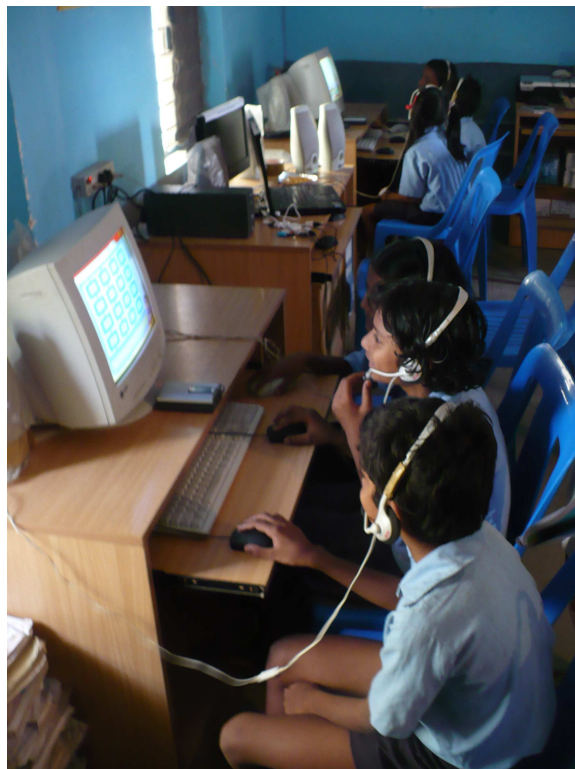
Fig. 6. Testing the Consensus Group