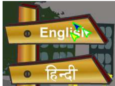
Fig. 2. User agreement is signaled by outlining the agreeing mice in green.