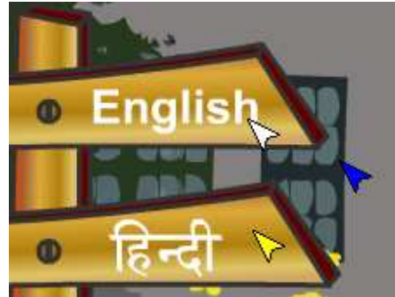
Fig. 1. The users (Blue, White and Yellow) have not agreed. Each cursor has a distinct color.

To achieve these goals, we developed Metamouse , a system for sharing legacy single-player educational content between multiple children using multiple mice with a single computer and display. In this section, we describe the design and implementation of Metamouse.